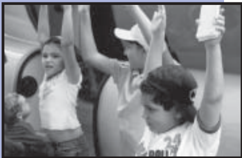
Kids Doing the Wiener Dance in front of the Wienermobile

For a listing of additional programs, call the Events Hotline at 974-7302 or visit cityofaustin.org/library/kids.htm