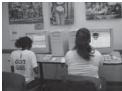
Taking classes@WFY Windsor Park

The Michael & Susan Dell Wired for Youth Centers offer youth from ages 8 to 18 the opportunity to expand their knowledge of computers and the World Wide Web through classes and individual instruction. All centers have at least seven computers with word processing, graphic design, web design, and animation software, as well as Internet access. Contact the WFY librarian or check out www.wiredforyouth.com for more information about activities at each center.