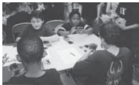
Kids playing Yu-Gi-Oh at WFY @Carver

But there are also important social and educational outcomes derived from playing games. Board games provide opportunities to develop and practice mathematical, logical, sequencing, verbal, and perceptual skills. They offer opportunities to learn to follow rules, work as part of a team, and improve communication techniques. Players quickly learn that there can only be one winner in most games, but if you stay in the game your turn to win will usually come. Playing games is relaxing and provides opportunities for young people to get to know each other. Next time you see games being played in the Library, stop and watch - or join in!