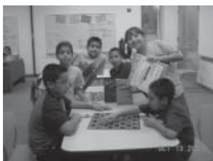
Winners of Checker tournament at WFY@Windsor Park

Visit the Oak Springs Branch Library and you might see a group of young people playing chess. At Little Walnut Creek Branch Library, weekly Scrabble games attract students. It's not unusual to find kids playing Connect Four, Checkers, UNO, or other board games at the library and tournaments are very popular, even though prizes are small. What's going on?