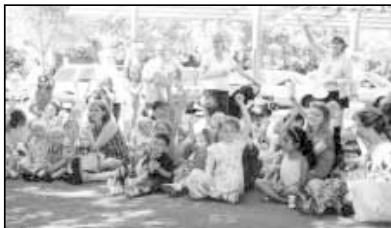
Families enjoying a 2003 Summer Reading Program Event